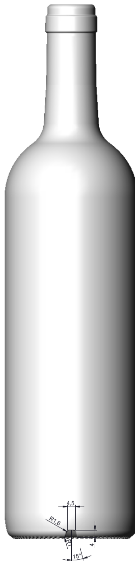
VISTA DE TRÁS BACK VIEW